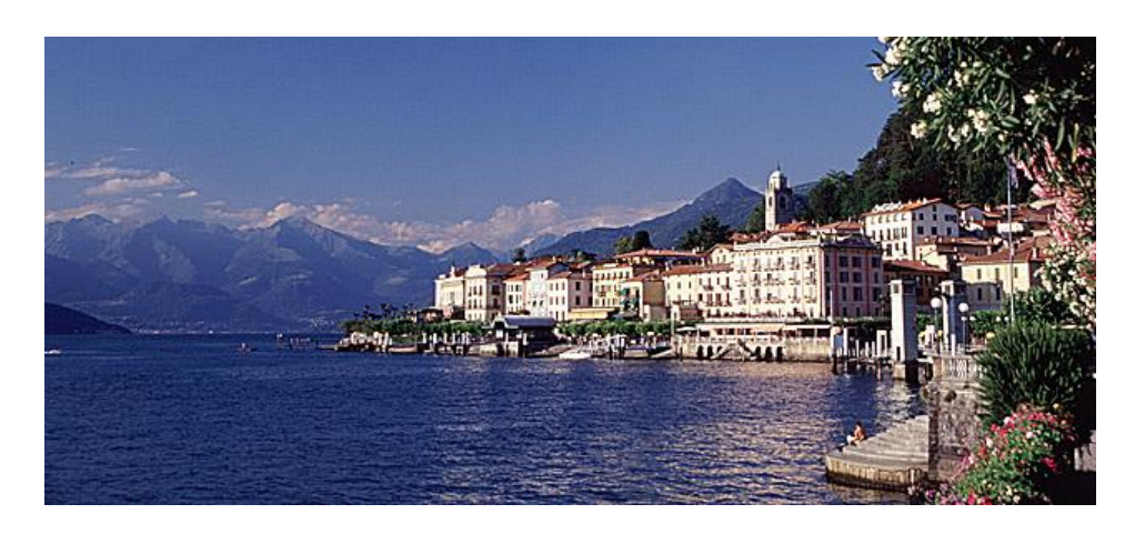
Bellagio: 10 min by car from Casa Orchidea